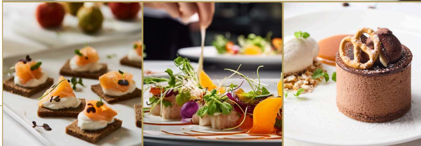
All images used are for illustrative purposes only